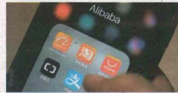
The burgeoning of e-wallets has created new non-banking players, like Alipay